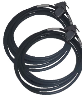
Beta Det. Cable BAK-0901 PM-11 Det. Cable BAK-0720