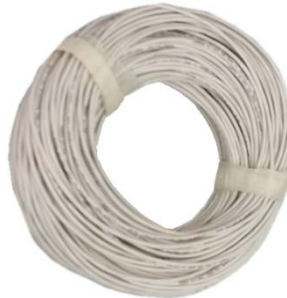
Communications Cable BAK-0198