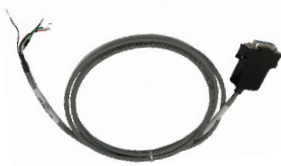
Cable to Conn. Unit BAK-0790