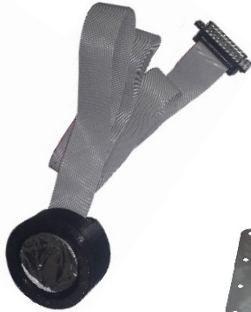
Beta Detector BAK-0177