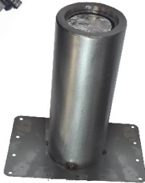
Stainless Steel Bracket BAK-1573