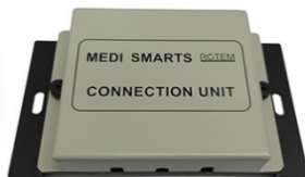
Connection Unit BAK-1000