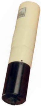
PM-11 Detector BAK-1510

The PM-11 Coincidence Exhaust Stack is made up of the following: